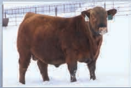
RED RREDS COMMON SENSE G933 sire of Lot 58