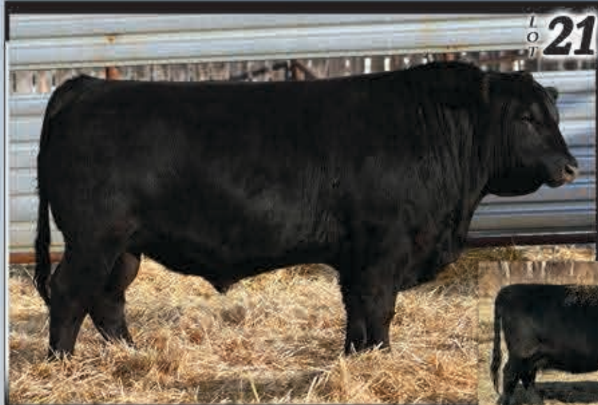
TATTOO: SHL 78L REG #: 2321724 2-YEAR OLD BULL

Long bodied, smooth made bull that would work well on heifers for calving ease and/or cows for making a tremendous group of females. He is a maternal sibling to the dam of lot 19 and the grand dam of lot 18. Our cow families have longevity. The Flo Rider daughters, 78L's paternal sisters are proving themselves very useful. See lots 13, 14, 16, 18. Dec 29 weight - 1595.