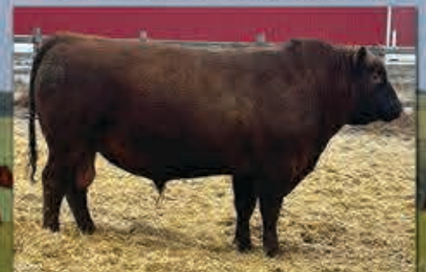
RED FLYING K LIGHTNING 44J Sire of Lot 64