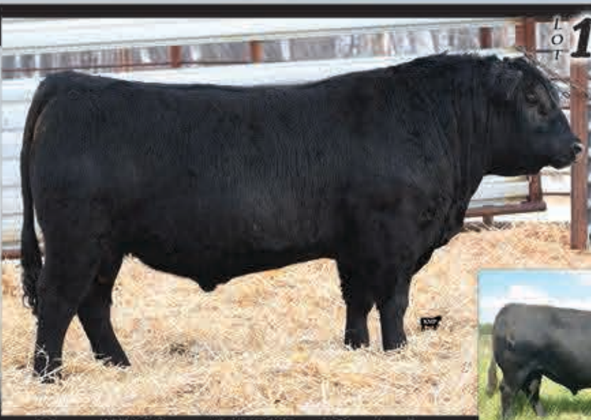
TATTOO: SHL 31L REG #: 2321804 2-YEAR OLD BULL