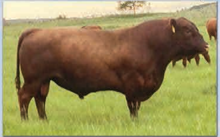
RED FLYING K NAVIGATOR 25G sire of Lots 50, 52, and 62; grandsire of Lot 64