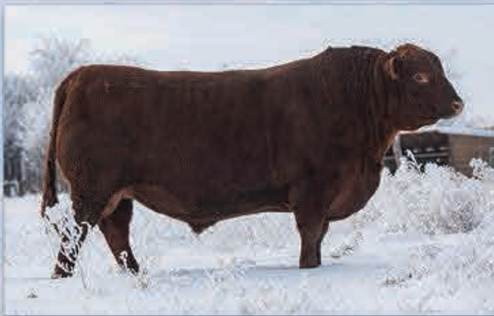
RED LONE HILL CROWN ROYAL 151F sire of Lots 53, 59-61, and 63

The 2025 bull sale sire group is mix of dependable genetics as well as some new genetic options. The newest sire group is that of CROWN ROYAL . I was fortunate to find him as a mature bull at Owen Pickett's herd by Meadow Lake. One of the easiest fleshing bulls you will find and made so right. His dam is a model angus cow and his full sister is impressive. Bulls off the Crown Royal bull are easy doing, stout and have great haircoats. Another new sire is 90K who we sold to Selte Land and Cattle. The sons off of him are great structured and are excellent options for the heifer pen. This will be the last set of NAVIGATORS . His sons exhibit his length of body, dark colour and awesome foot structure. His daughters are beautifully made cows. Other sires include the $50,000 US valued COMMON SENSE ; the dependable REGAL , a son of Moose Creek CLOONEY , as well as a son off our resident heifer bull in LIGHTNING 44J . All these sires were selected and utilized based on overall structure, calving ease with performance, predictability, fleshing ability and the dam behind them.