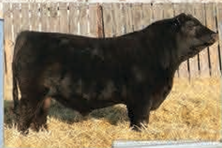
SHL 88K Maternal Sib of Lot 7