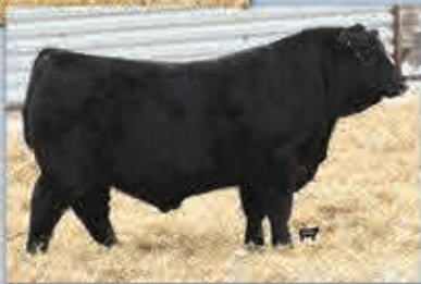
SHL 49L Son of Maternal Sister of Lot 7