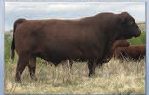
FLYING K ROOSEVELT 46C Grand Sire of Lots 53, 60-63