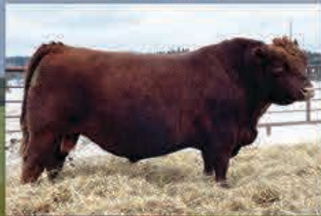
RED FRASER REGAL 909G Grand Sire of Lot 51