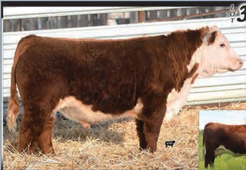
TATTOO: SHL 111M REG #: C03120545 YEARLING BULL

Younger calf with a moderate birthweight and growth. This guy was purchased in dam from the Square-D Herefords Dispersal sale in 2023. His dam is a large bodied Century daughter with a good udder. Despite his March birthdate, 111M performed fairly well in a group of mostly January calves. He is attractive; clean in his lines, smooth bodied, and square made.