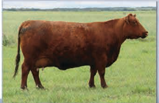
Red Spittalburn Missey 314A Maternal Grand Dam - Flush Cow