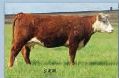
28W - Maternal Great Grand Dam