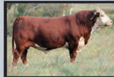
HEREFORD REFERENCE SIRE