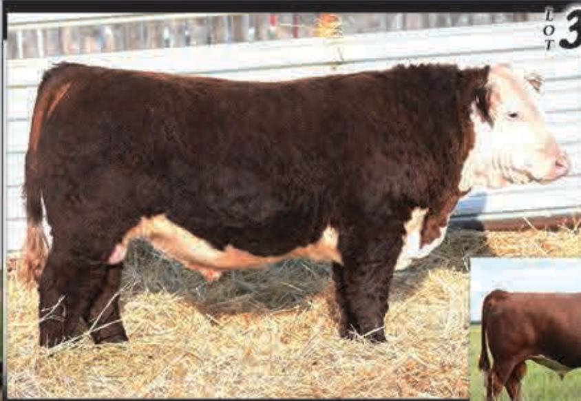
TATTOO: SHL 120M REG #: C03114673 YEARLING BULL

Cyclops 120M is a good option for the heifer pen. His first calver mother is a daughter of our Clara 6G cow that we are very high on. She won Champion Cow/-Calf pair at the NW Hereford Field Day. 120M has length of body, bold rib expression, and a decent hip in him. He has 85% eye pigmentation.