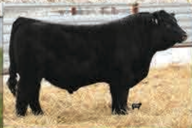
SHL 64L Maternal Brother to Lot 3