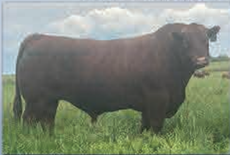
RED EYE HILL SLOWBURN 90K Sire of Lots 56 and 57