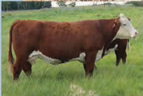
Standard-Hill 173A Logan 187E Maternal Grand Dam of Lot 29