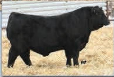
SHL 49L Maternal Brother to Lot 2