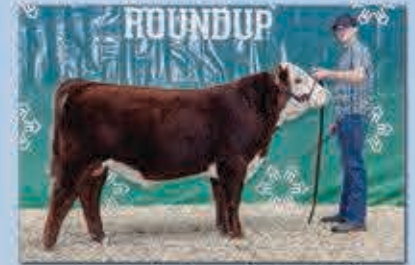
Stockade Round-Up 2024