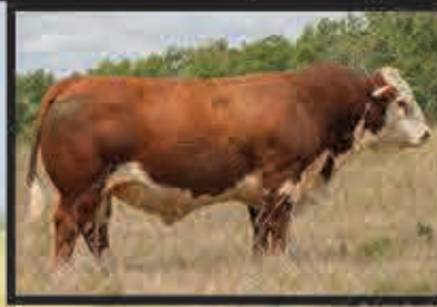
Square-D Heavy Dose 276F Sire of Lot 36

Mater is a performance bull with a lot of red meat. He is an aggressive breeding bull. He'd breed the whole herd and look good doing it. Great bunch of replacement heifers off him coming online this calving season.