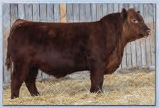
PBS 69L - Maternal Brother to Lot 53