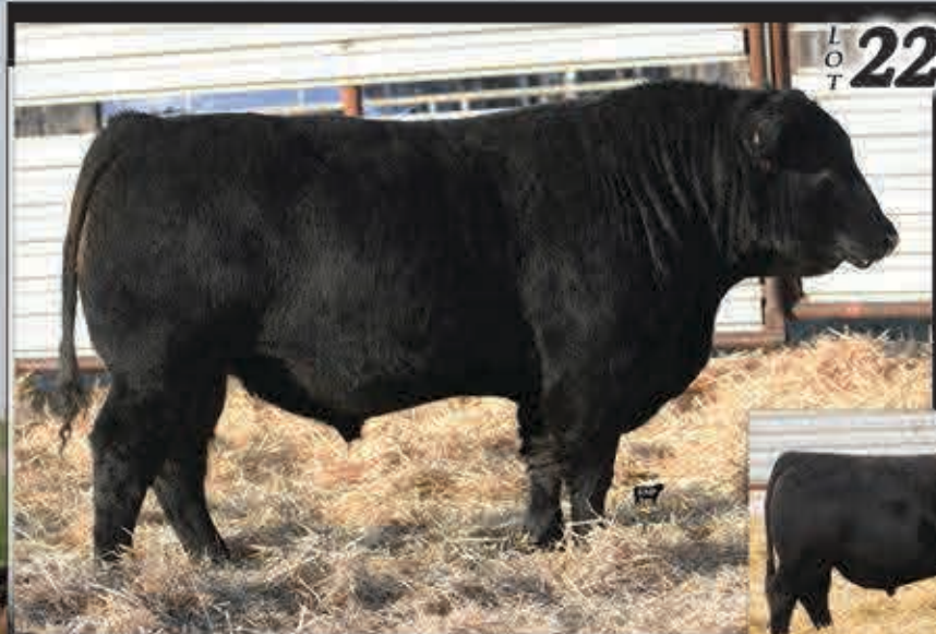
TATTOO: SHL 22L REG #: 2321748 2-YEAR OLD BULL

Stocky made Flo Rider son with a very maternal dam. 22L is long, deep, and smooth. He has a good hip and good Angus character. His dam is a maternal sibling to our Major 350C, and her cow lines all through our sale offering. Heavy weight bull at last weight and one of the largest testicled. December 29th weight - 1650.