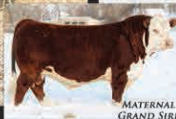
MATERNAL GRAND SIRE