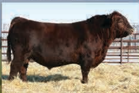
RED MOOSE CLOONEY 20D Sire of Lot 55 Connection Sale 2025