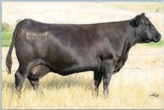
Full Sibling of Paternal Grand Dam of Lots 11-14