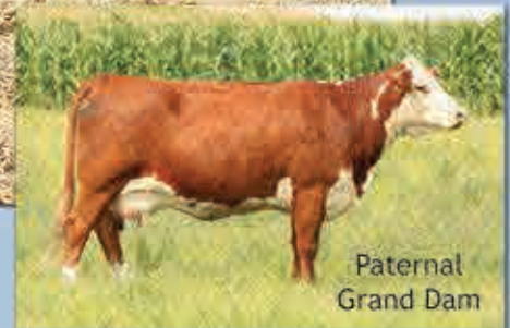
Paternal Grand Dam

Attractively marked and made Ace son with a moderate birthweight. If we could paint them all like this we would. He has red in all the right spots; red eye, red neck, red legs, red scrotum, but he'll put you in the black. Great skeletal extension in this guy to go with ample muscling, rib dimension, and level lines. His dam is 1500 lbs cow with a great udder and milk flow. This guy is super quiet and easy to work with but should still have the libido to get it done. December 29th wt - 1660.