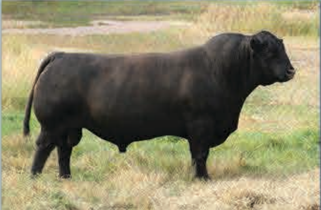
Sire of Lots 16-18 2-year olds