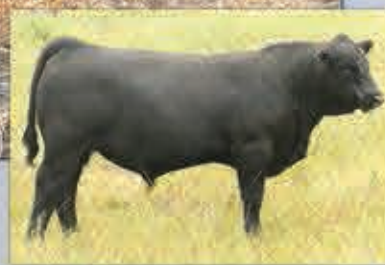
Full Brother of Lot 1